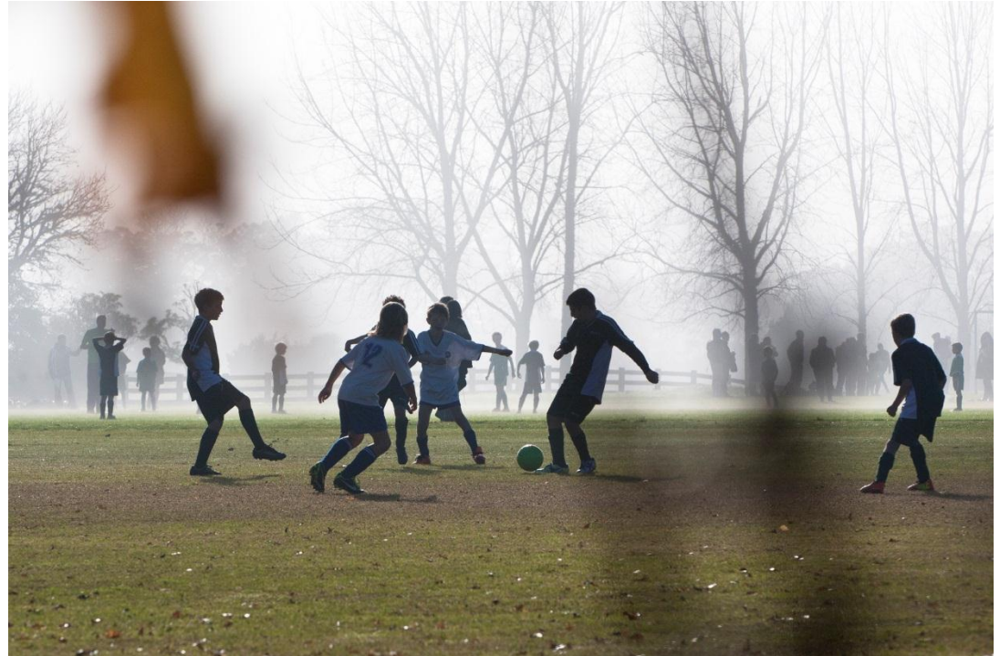
Wainoni Park has undergone significant upgrades over recent years, prompted by major residential growth in the area and a demand for more local recreational opportunities.

The community clearly appreciated the result, with the reserve delivering significantly wider community attributes than sport alone.