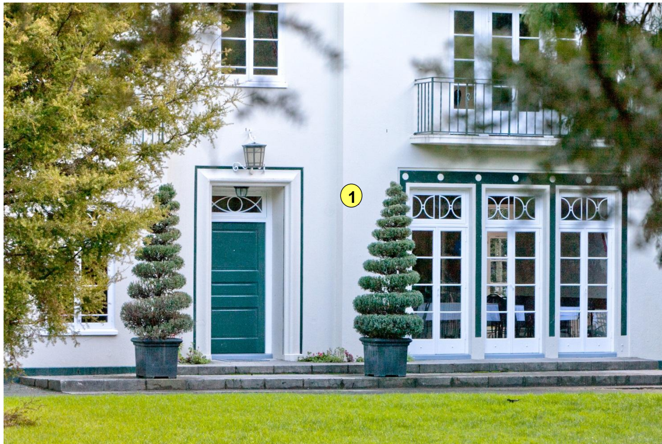
The Beaufords Reception Lounge, a restored historic homestead, is now a popular venue for weddings and other functions.