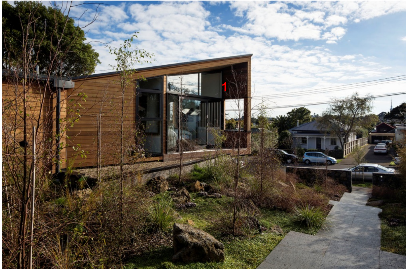
Looking down the pedestrian access way towards Prospect Terrace from the main entrance level – east elevation of S house to the left of the image.