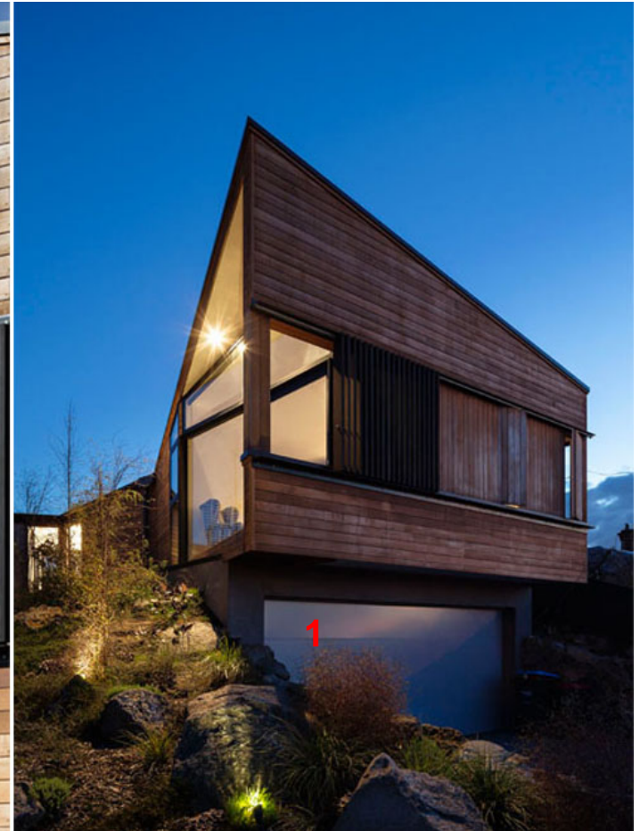
(left) close up of half gable roof form, (right) looking towards the set back double garage from Prospect Terrace.