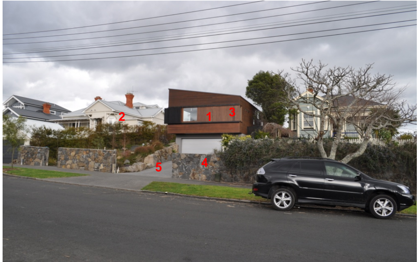
Looking towards the front elevation of S-House from Prospect Terrace.