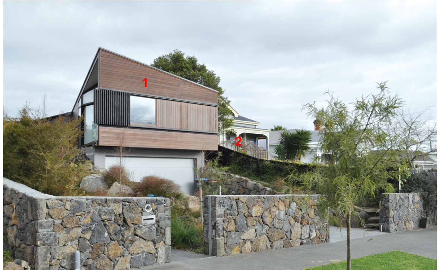
Looking towards the front elevation of S house from Prospect Terrace.