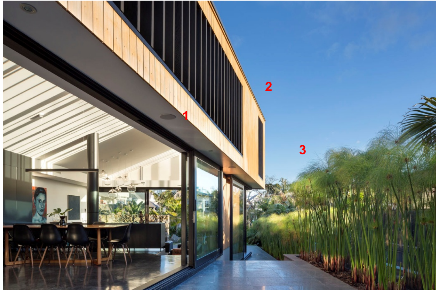
Looking towards the back wing of S house – west elevation.