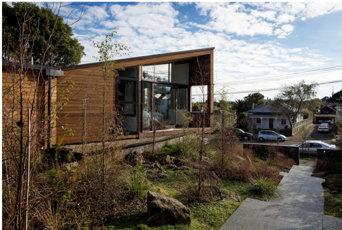
Looking down the pedestrian access way towards Prospect Terrace from the main entrance level – east elevation of S house to the left of the image.

The architects started by taking the idea of a traditional bay villa, which tends to be internally focused with the exception of front rooms facing the street. A villa is usually centred on a site with an internalised corridor leading down the centre of the house from the front to service rooms in the rear. The design team took this idea and deconstructed it. The two halves of the building are split and shunted, one half to the front, and the other to the rear of the site with a circulation spine weaving through the more communal spaces of the house. This maximises the interior to exterior relationship while still taking the front door to the middle of the site.