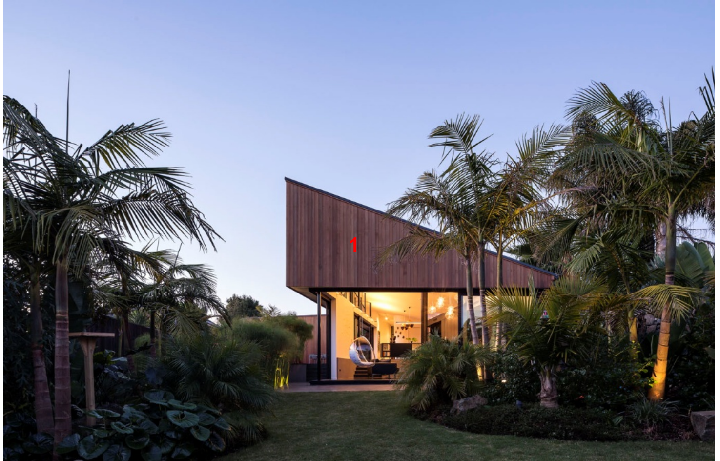
Looking towards the back wing of S house – south elevation.