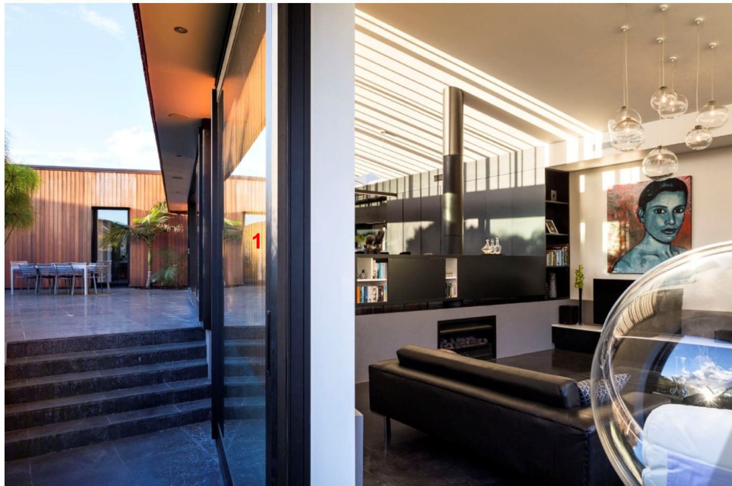
Looking towards the front wing of S house – east elevation.