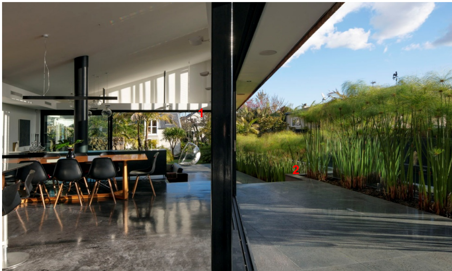
Relationship between indoor and outdoor flow at S house.